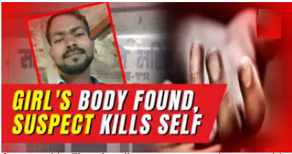
GIRL'S BODY FOUND, SUSPECT KILLS SELF

The crime came to light Tuesday evening when hostel authorities went looking for her as she was not responding to calls. When they looked signed at the main gate about going out, they found her into the room through a window, they room locked from outside. When they looked into the room found her body lying naked on the floor through the window, they saw her body. The hostel between two beds. The room was locked