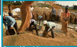
Govt. to hike minimum support price of agricultural products for Kharif season

Police said the CCTV camera at the south Mumbai hostel's ground floor caught him leaving a bundle of laundry clothes near found her body lying naked on the floor through the window, they saw her body. The hostel between two beds. The room was locked